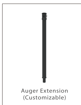
Auger Extension (Customizable)