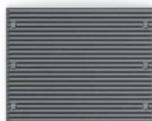
Fine Jaw Plate